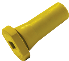
Colostrum Calf Teat 265-0001