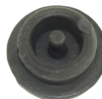
Teat Plug 265-1005