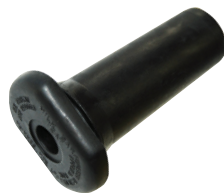
Round Hole Calf Teat 265-0003