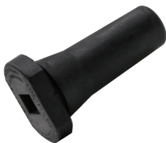
Calf Teat 265-0002